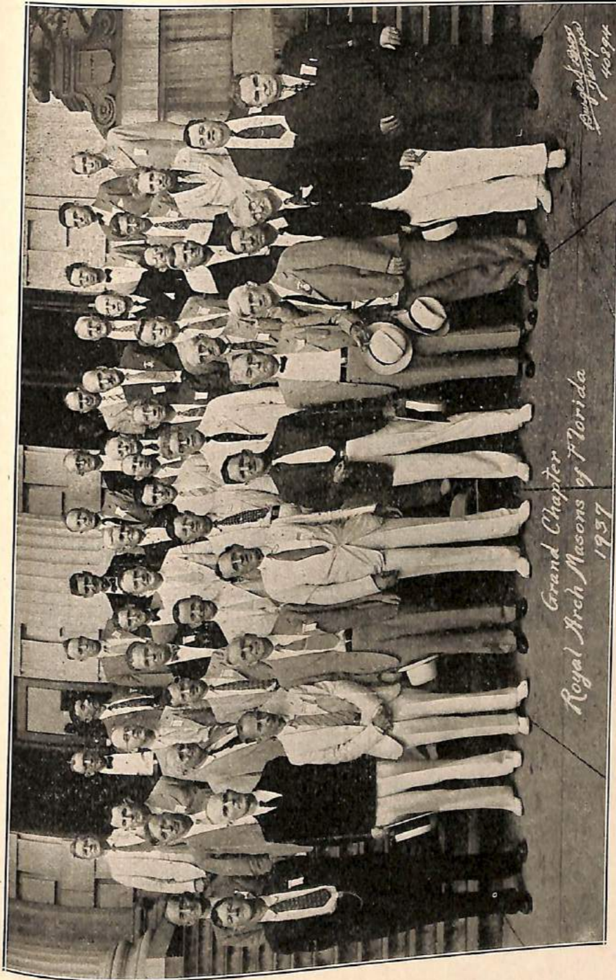
Grand Chapter Royal Arch Masons of Florida 1937